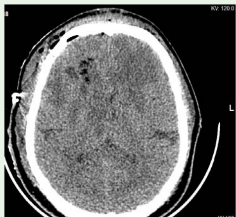
Figure 3: Follow-up CT scan brain 10 days (Before surgery) after abscess drainage.