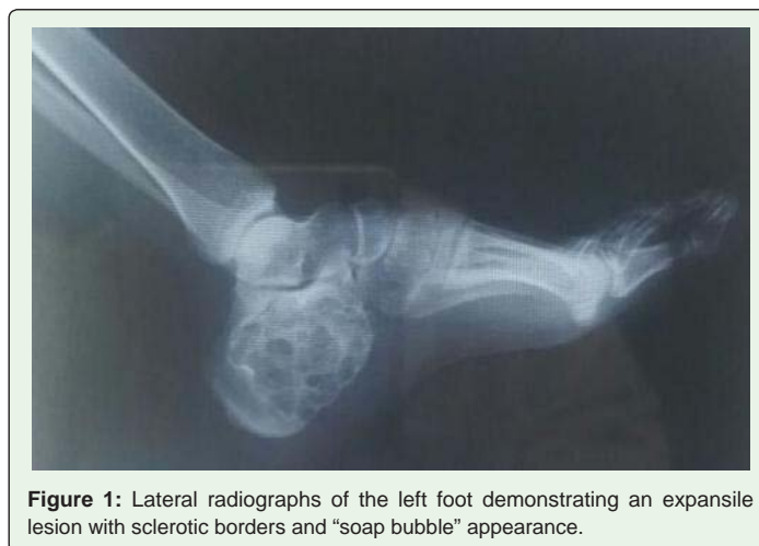
Figure 1: Lateral radiographs of the left foot demonstrating an expansile lesion with sclerotic borders and “soap bubble” appearance.

A 22-year-old man presented with chronic left ankle pain of 2 years duration. He related that her pain was aching and throbbing in nature and aggravated by movement such as walking and standing and the toe off portion of gait. Associated symptoms included decreased mobility, limping, swelling, and tenderness on examination. Previous treatment included hardware removal from the ankle, non-steroidal anti-inflammatory drugs, oral and injectable steroids, and immobilization without success. The physical examination revealed an antalgic gait with mild localized edema to the left lateral ankle and lateral calcaneus. Radiographic evaluation of the left foot and ankle revealed a well circumscribed, geographic lesion in the body of the calcaneus measuring 4 x 3.5 cm, without calcification (Figure 1). A computed tomography scan was performed to evaluate the cortex of the