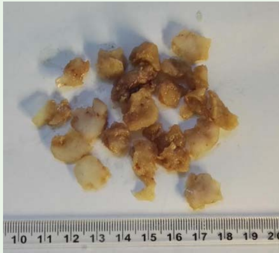
Figure 2: Gross appearance of CMF, fibro-gelatinous substance with pieces of cartilaginous material.